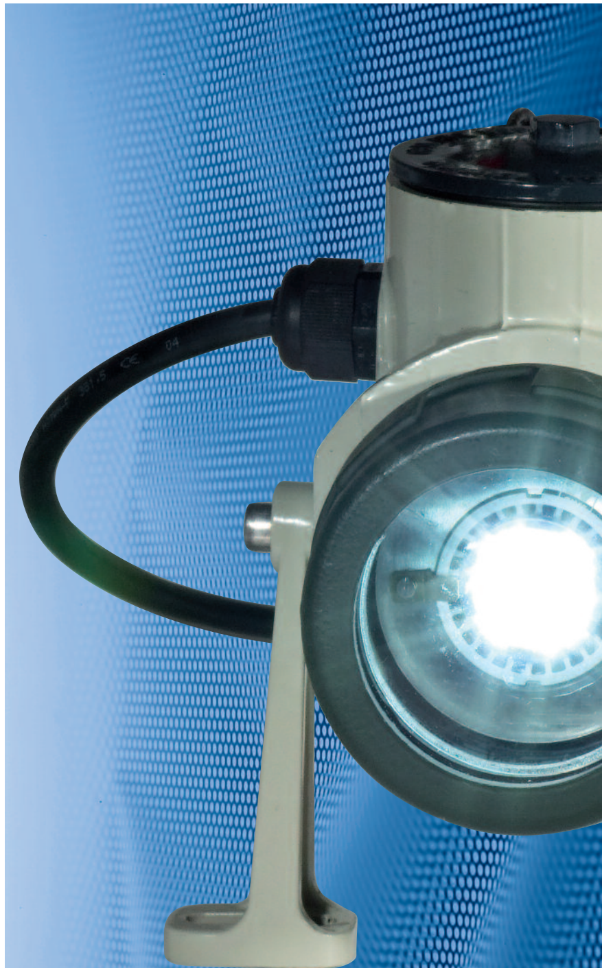
Polar curve KFL 7 LED

With the light fitting holder PR it can be mounted on inspection windows according to DIN 28120.