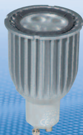
Philips 7 W LED lamp