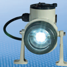
KFL 7 LED